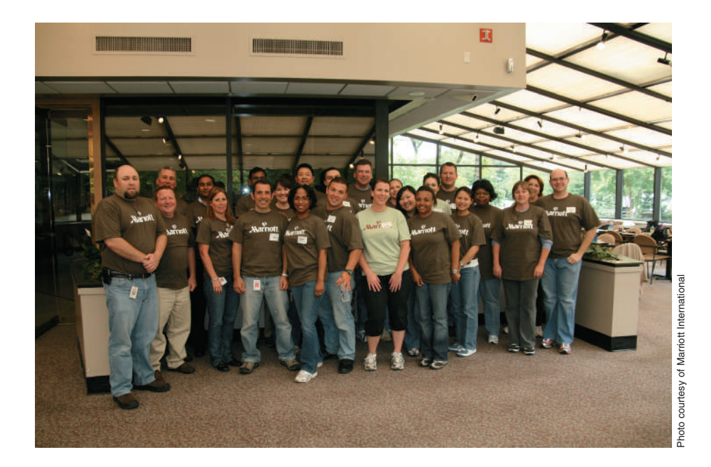
People who work together often associate off the job. Groups at work can also create social groups outside of the work environment.

Social groups form alongside or as part of work groups for a variety of reasons. People who work together tend to have things in common: what they do, when they do it, and who they do it with. They not only work together on the job every day but also may associate off the job. They have things in common to talk about, shared experiences, and constant reminders of their common basis for acquaintance, which serve as reasons to continue their on-the-job relationships. Since the best hospitality organizations use careful